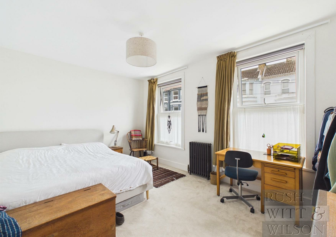
RUSH WITT & WILSON