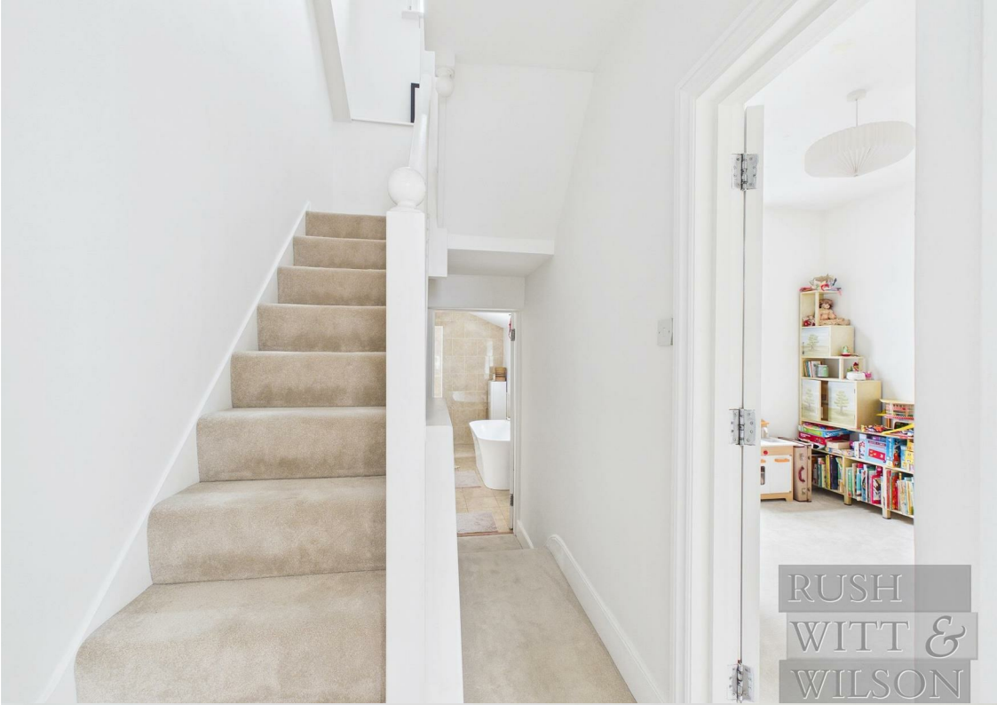
RUSH WITT & WILSON