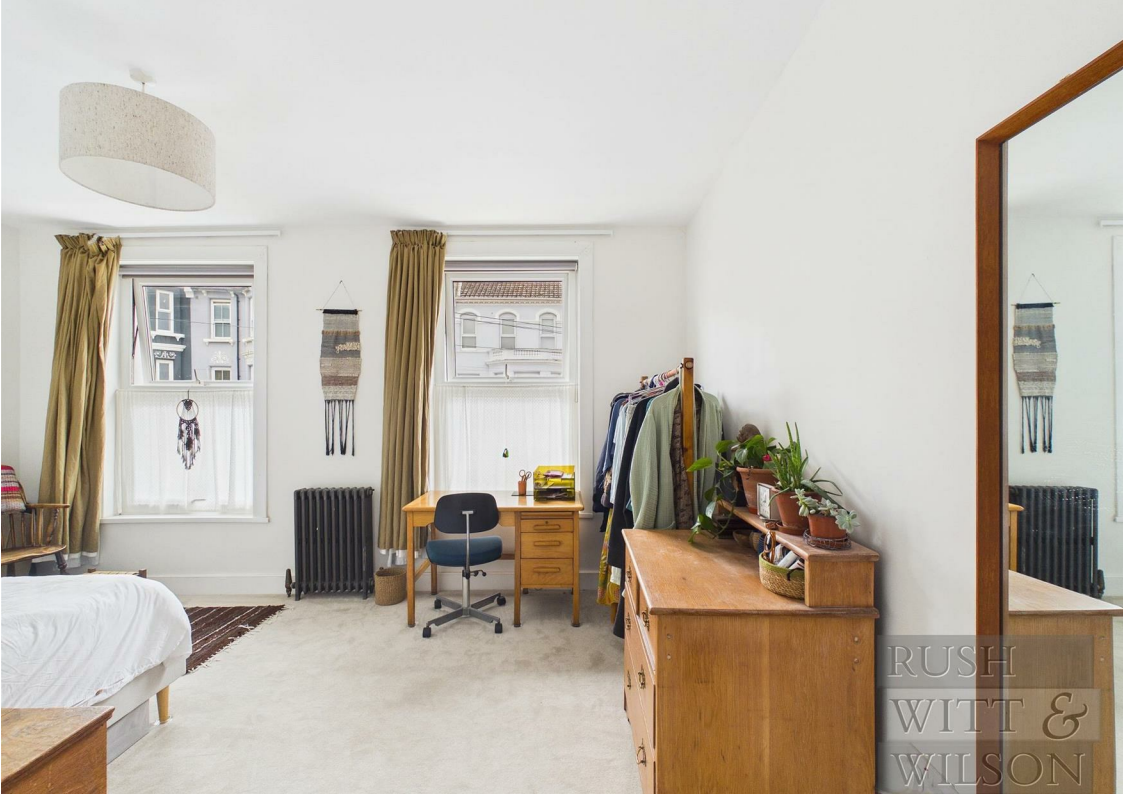
RUSH WITT & WILSON